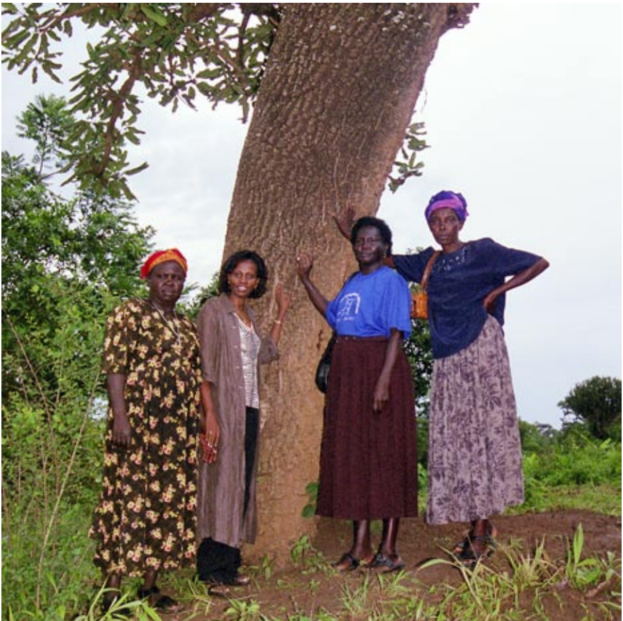
Lady gatherers and their organic Shea Tree – Wild Harvest Organic Certification