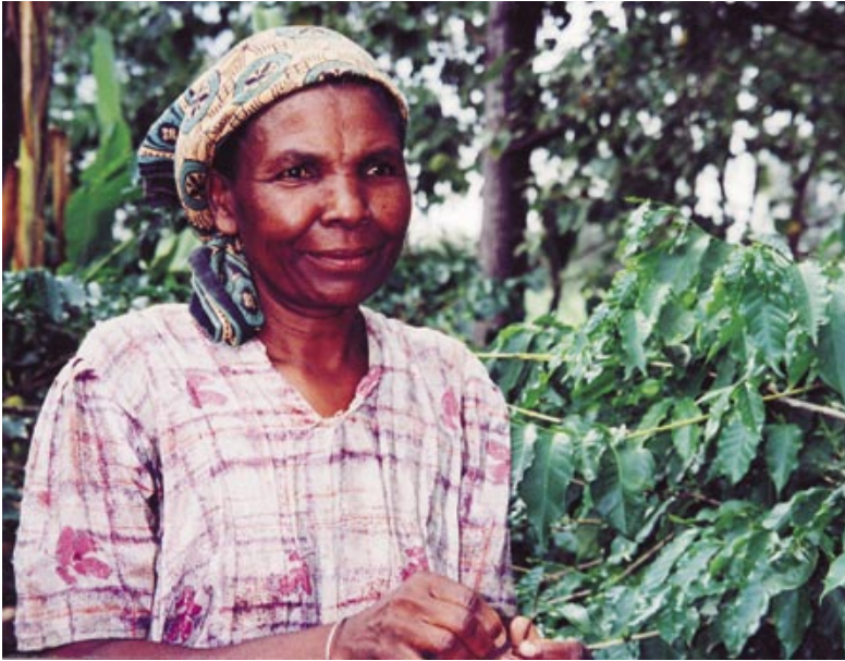
Female farmer by her organic Arabica coffee in the KNCU project, Kilimanjaro, Tanzania, 2004. The EPOPA programme results in improved income for thousands of smallholders.