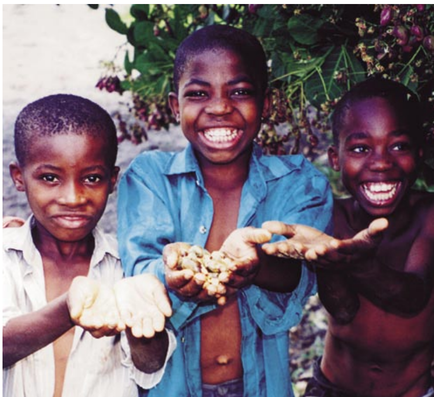
Three boys from Kerekese, south of Dar es Salaam in Tanzania. When the first boy proudly showed the freshly harvested organic cashew nuts the other two also wanted to – but they had no nuts ready for the photo!