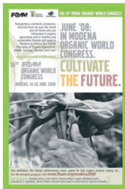
Organic World Congress advertisement