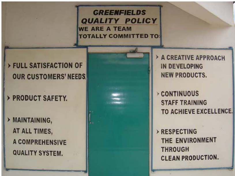
Greenfields Quality Policy displayed at the Factory Entrance